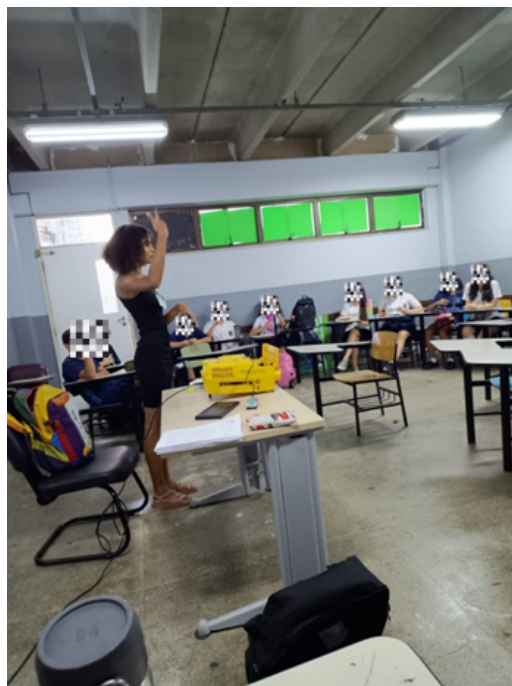
Figure 6 – Resident presenting Yoruba mythology to students