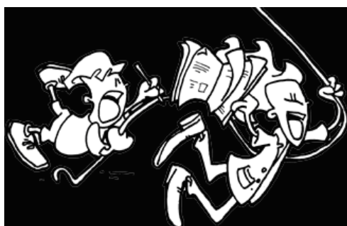
Figure 3: The Risk-Taker Teacher

The images "stimulating, encouraging and comfortable" related to "atmosphere" and "environment" used by Jennifer to refer to teaching and learning also condense metaphorically her feelings, values, needs and beliefs, may guide intuitively her teaching, and lead us to depict her as a risk-taker teacher, in the sense that she is always creating different and challenging activities to encourage and stimulate students' participation in class.