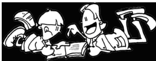
Figure 2: The Interactive Teacher