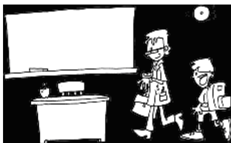
Figure 1: The Knowledge Transmitter Teacher*