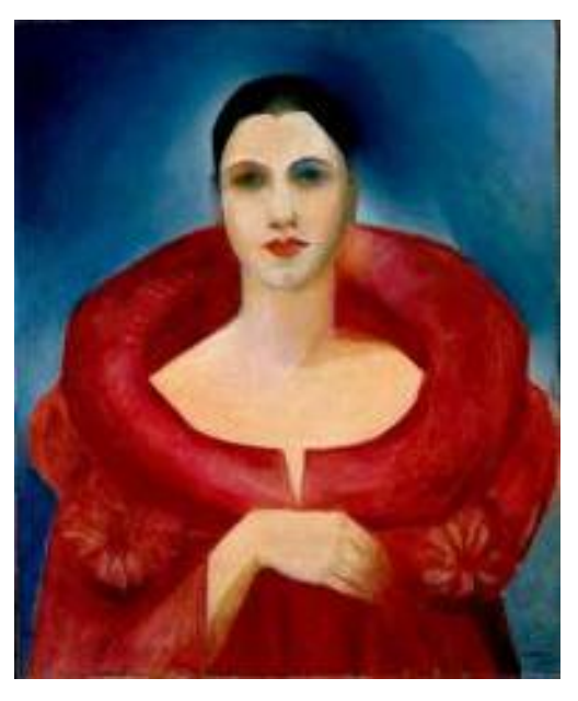
Source: MNAB. Available at: http://bit.ly/3kd4IIdTA23a Figure 4 – Self-portrait or Le manteau rouge

Painted wooden sculpture, 19th century, Bahia. Source: Private collection, SP. (In Araújo, 1988, p. 188). Figure 3 – Iemanjá