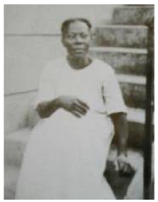
Figure 1 – Family employee