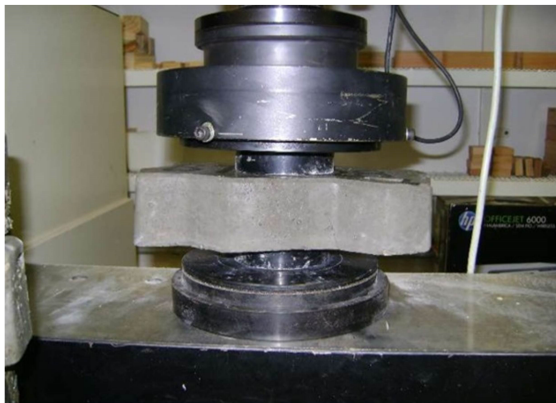
Figure 3 – Paver placed in the DL3000N testing device.