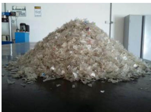
Figure 1 – PET flakes used in the concrete paving blocks.

FILHO et al. , 2019; PIRES 2015; TAPKIRE et al. , 2014). The same percentages of coarse aggregates and sand were taken from the concrete to add the PET flakes to it, e. g., the addition of 15% of PET in the concrete by volume was made by decreasing 15% of coarse aggregates and 15% of sand, both of them by volume as well (MODRO et al. , 2009; PASCHOALIN FILHO et al. , 2019; PIRES, 2015). This procedure aimed at avoiding the lack of mortar if only sand is replaced by PET; similarly, it aimed at avoiding the occurrence of plenty of mortar if only the coarse aggregates were replaced by PET (PIRES, 2015).