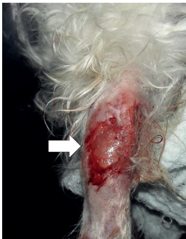
Figure 1. Cutaneous laceration (white arrow) in the distal cranial region of the right tibia caused by a delicate friction from the removal of an adhesive tape that attached the venous catheter to the skin. Canine, Maltese, female, one-year-old.

Then, we decided to determine the CEI by measure the height of the dorsal fold (A) and the distance from the occipital crest to the tail (B). The CEI was calculated from the formula CEI (\%) = A/B \times 100 . In the case served, these values were A = 6.2 cm and B = 28.0 cm, which resulted in a CEI of 22%.