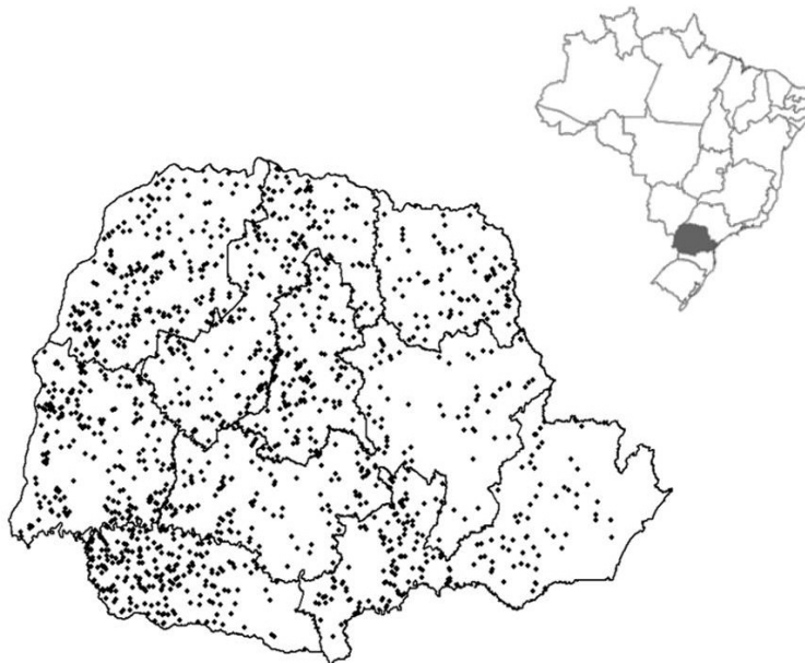
Figure 2. Location of Paraná within Brazil and spatial distribution of sample herds.

Figure 2 shows the distribution of sampled herds throughout Paraná. The responses to the questionnaire completed during the farm visits indicated that Paraná was primarily characterized by small cattle herds dedicated to extensive grazing dairy farming (41.1%) or mixed, dual-purpose, livestock production (42.2%). Only 21.7% of the herds had some degree of confinement, and 16.7% were classified as beef cattle. Only 25% of the farms possessed more than 22 animals of at least 24 months of age. Rented pastures or shared areas between neighboring farms were not very common, reported in only 10% of the sampled farms.