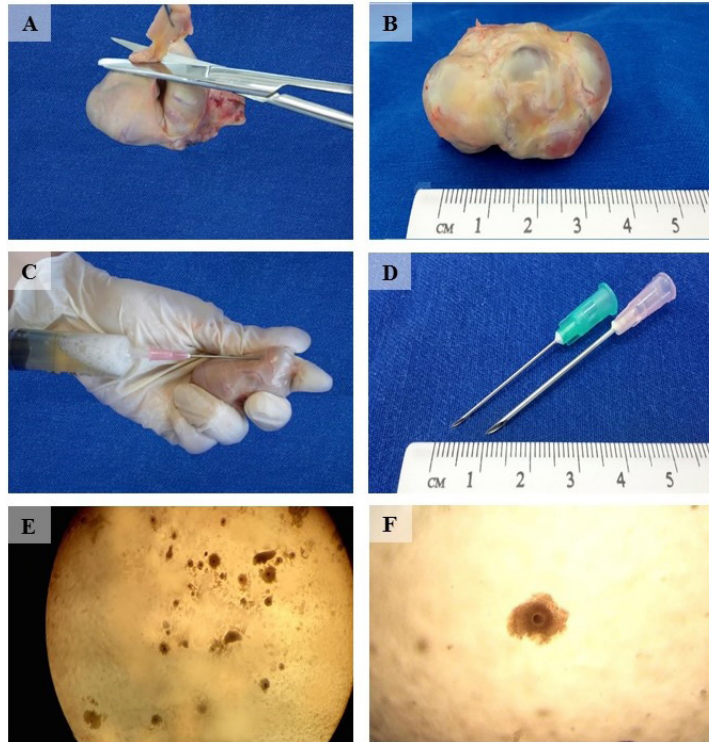
Figure 2. Experimental protocol describing equine oocyte recovery by the follicular wall scraping technique, with different specifications of needles and morphological analysis of the cumulus oophorus.