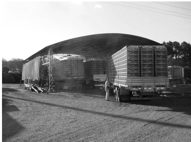
Figure 1. General view of the pre-slaughter environment for broiler trucks in a commercial slaughterhouse.

The environment temperature is controlled by fans installed on pillars and trusses (four rows with seven fans each), while eight high pressure misting sets are interspersed with the fans, each with 25 nozzles. The sides of the holding area have polypropylene panels to protect the truck's