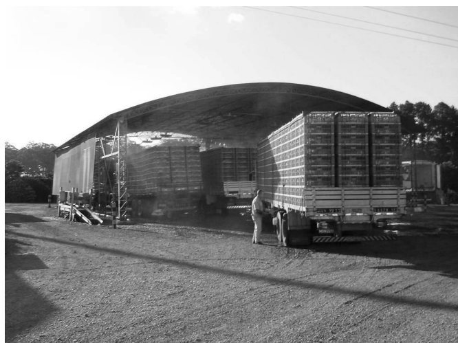
Figure 1. General view of the pre-slaughter environment for broiler trucks in a commercial slaughterhouse.

The environment temperature is controlled by fans installed on pillars and trusses (four rows with seven fans each), while eight high pressure misting sets are interspersed with the fans, each with 25 nozzles. The sides of the holding area have polypropylene panels to protect the truck's