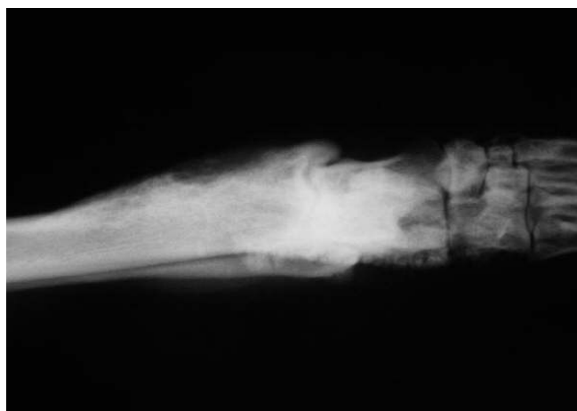
Figure 1. Image showing irregular periosteal proliferation in the cranio-medial aspect of the left radius, with circular osteolytic areas, secondary to bone sporotrichosis, in a 3-year-old dog, a Boxer.

Bone and lymph node biopsies were performed and carpal, radial, and popliteal lymph node fragments were collected and subsequently sent for histopathological analysis and for bacterial and fungal cultures. A histopathological evaluation was performed using the popliteal lymph node, which revealed partially obliterated tissue architecture from an intensive multifocal and coalescent inflammatory infiltration, composed mainly of neutrophils and macrophages. Areas of coagulation necrosis with fibrin deposition were also observed. The results of a special fungal staining technique (PAS c/d) were positive and revealed rare, round, ovoid fungal structures of approximately 8 \mu\text{m} in diameter among the inflammatory cells (Figure 2).