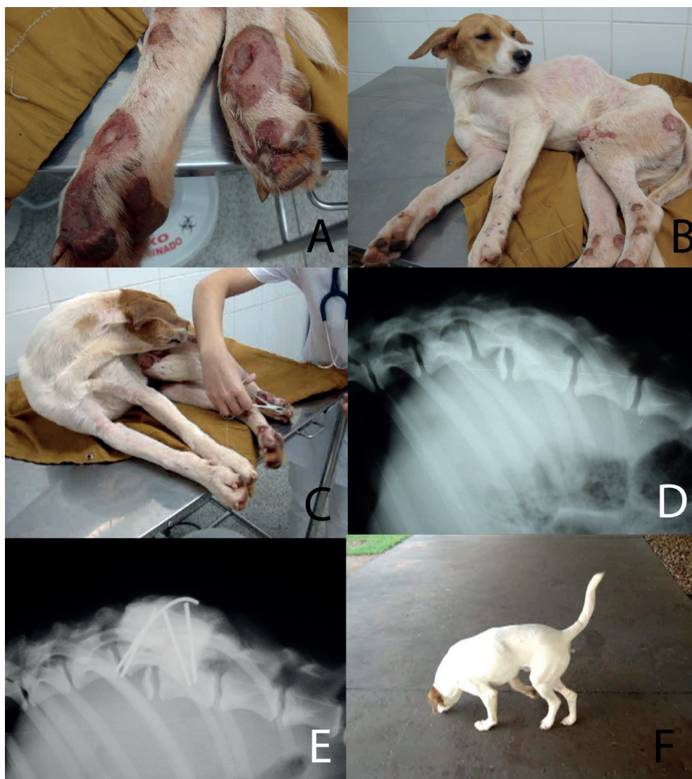
Figure 1. Photographs of a mixed breed dog, approximately 10 months old, weighing 13 kg, diagnosed with a fractured T13 vertebral body and luxation between vertebrae T13 and L1. 1a. infected wounds on digits of the posterior limbs with bone exposed; 1b. Schiff-Scherrington posture and wounded bony protuberances of the ischial tuberosity, stifle, and tibiotarsal joints; 1c. A conscious response of the patient is observed when testing deep nociception; 1d. Pre-operative radiography of the thoracolumbar spine, revealing a fractured caudal epiphysis of the T13 vertebral body with luxation between vertebrae T13 and L1, and complete vertebral canal luxation; 1e. Postoperative radiography of the thoracolumbar spine. 1f. The patient walking, with an erect tail, and without wounds 110 days after surgery.