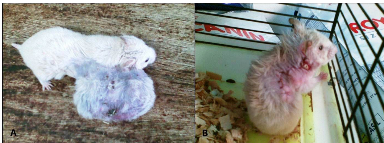
Figure 1. Myxosarcoma in a hamster. A. Notice the greyish tumoral growth in the right thoracic region. B. Animal recovered completely 3 months after surgery.

Histologically, the neoplasm was composed of pleomorphic, fusiform cells loosely arranged, randomly distributed, and presenting a moderate amount of basophilic amorphous stroma. Neoplastic cells varied from fusiform to stellate, with a moderate nuclear pleomorphism and scarce cytoplasm (Figure 2A). There were also hemorrhagic areas within the tumor mass (Figure 2B). Basophilic mucinous stroma was present in most sections stained with hematoxylin and eosin, being positive using Alcian blue staining (Figure 2C), as described by Shilton et al. (2002). Microscopically, von Bomhard et al. (2007) described similar findings in nine cases of myxosarcoma affecting rabbits as well Snyder, Davies and Keiss (1979), Shilton et al. (2002), Singh et al. (2006) and van Zeeland et al. (2006). Headley et al. (2011) described similar findings in a myxosarcoma in a dog, but associated with vascular invasion and metastasis to the lung, which not happen in our case.