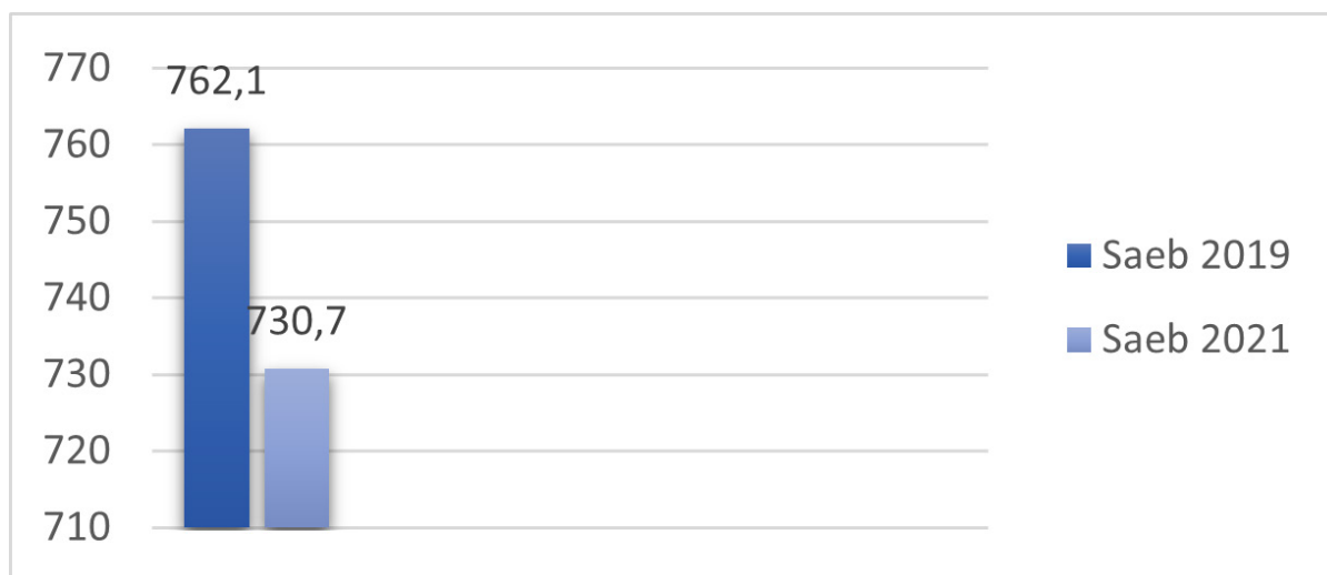
Graph 1 – Proficiency in Portuguese Language, SAEB, 2nd grade of the Early Years of Elementary School, Paraná, 2024

Source: Adapted from the SAEB Results Report (Brazil, 2024b, p. 41).